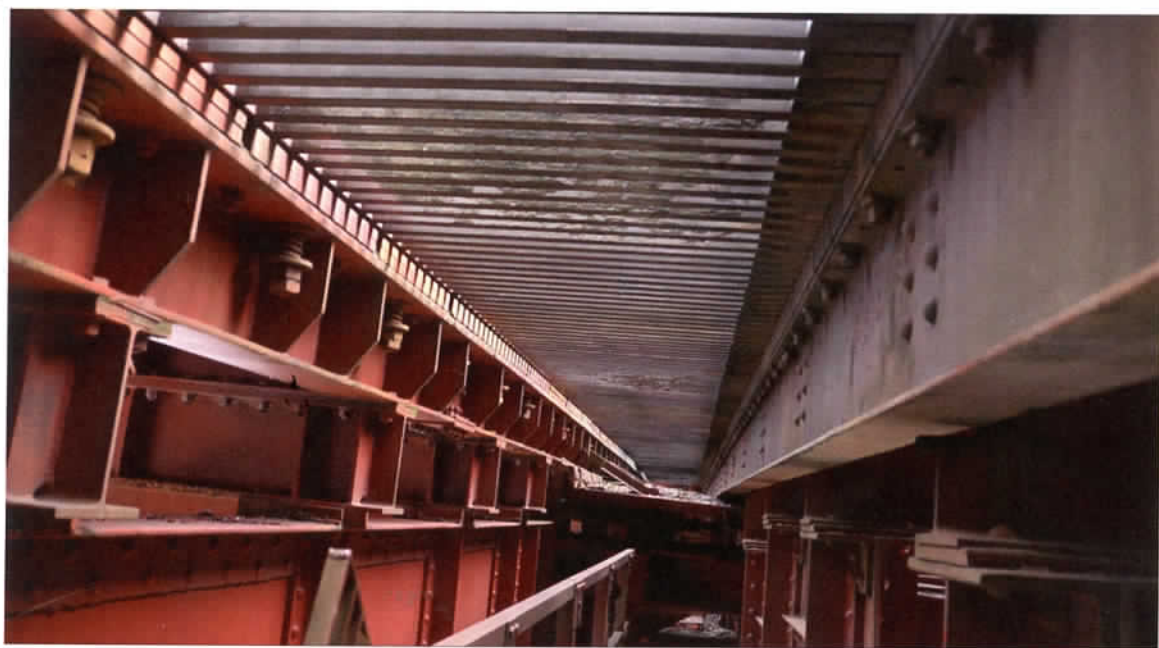
TOP Bill Fontana, Acoustical Visions of the Golden Gate Bridge (2012)