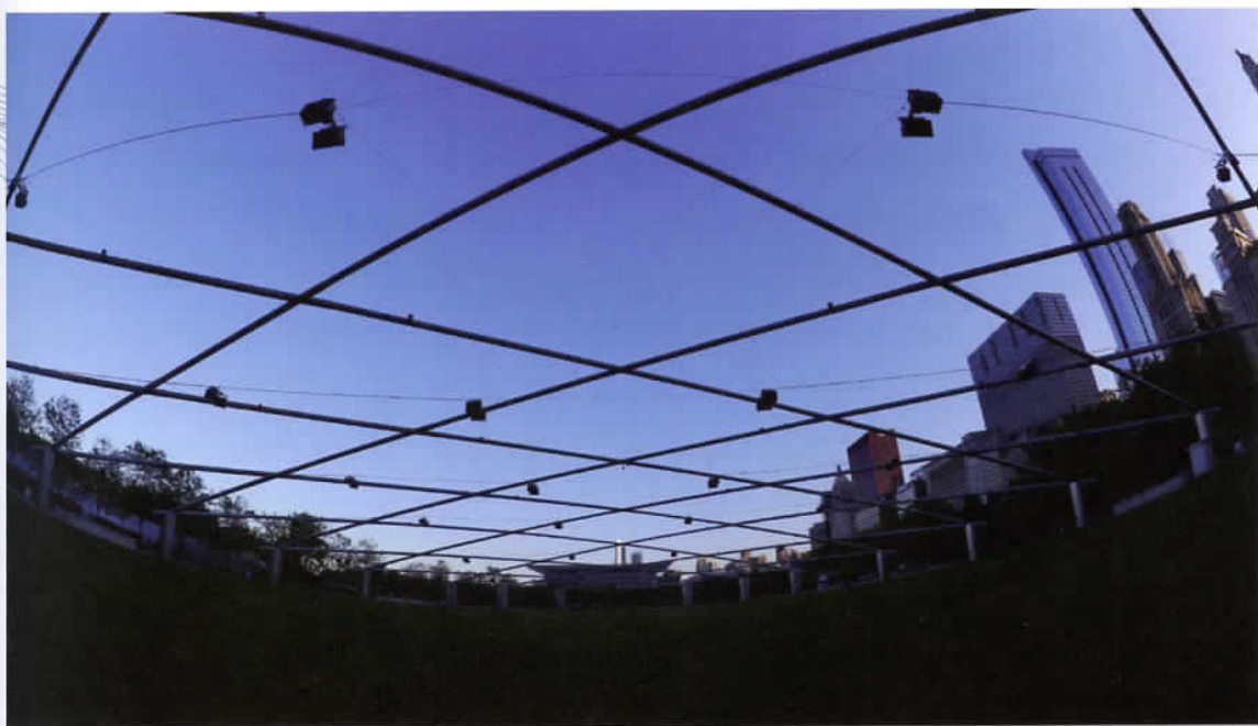
ABOVE: Pritzker Pavilion in Chicago's Millennium Park at the time of installation for Soaring Echoes

voices to address, for example, notions of collectivity and commerce, as in Public Calls that layers the roaring cheers of fans at a baseball game and traders' calls during the Open Outcry at the Chicago Mercantile Exchange.