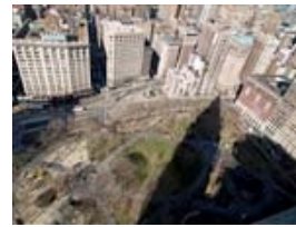
An aerial view of Madison Square Park, where the sounds of "Panoramic Echoes" are projected from neighboring rooftops