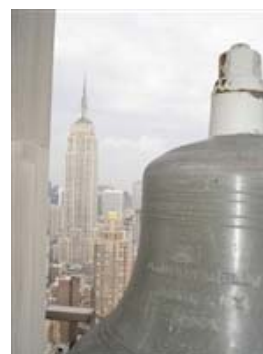
The sound of the Metropolitan Life Tower's bronze bells are part of Bill Fontana's sound sculpture, "Panoramic Echoes"